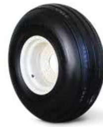
14L x 16.1 12 Ply