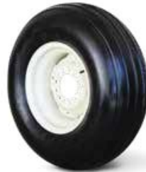
11L x 15 8 Ply